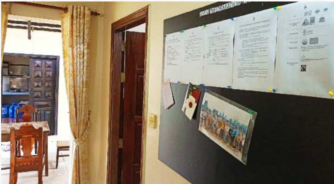
Figure 2. Information board for internal communication