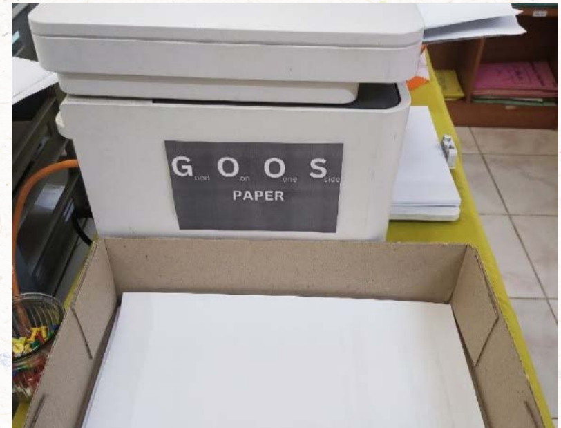
Figure 3. Collection of Good On One Side (GOOS) paper